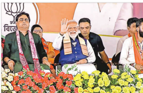
Prime Minister Narendra Modi during a rally at Bongaon, in North 24 Parganas on Sunday

Coining an obvious antonym of Mamata Banerjee's name, the PM described the ruling dispensation as a "nimam sarkar" (cruel government) that thrives on fear and intimidation. Speaking at the Matua community citadel of Thakurnagar at Bongaon in his first rally of the day, Modi also said all refugees who took shelter in India following religious persecution in the neighbouring nation will be granted citizenship through procedures outlined under the Citizenship Amendment Act.