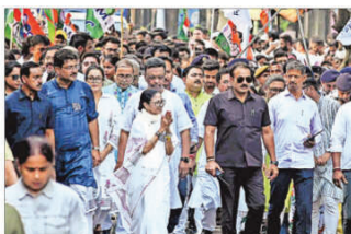
West Bengal Chief Minister Mamata Banerjee greets supporters during a road show at her constituency, Bhabanipur, on Sunday

"Over 200,000 central forces have been brought to Bengal along with armoured vehicles used by the Army in Kashmir for a state Assembly poll at the instruction of Modi and Shah. Will they explain where these vehicles and security were when Pakistan-sponsored terrorists sneaked into Pahalgam and gunned down 26 civilians?" she said at a meeting in Camac Street area.